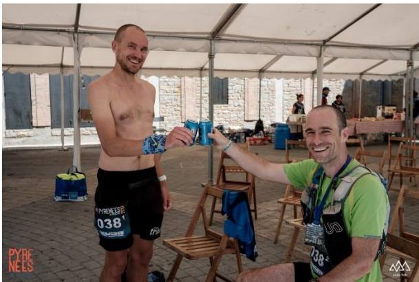
One last finish line beer

At the finish we were applauded over the finish line and given our medals, which was emotional in itself, but that was only the beginning of a special afternoon and evening. As each subsequent team approached the finish the cheers got louder as the crowd got bigger, and there