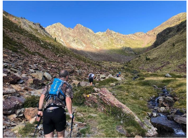
Long climb, with the Germans just ahead

The day started with a couple of kilometres of uphill but runnable tarmac, before settling in to a long sustained 1400m climb. As usual, we were close to the Belgians and Germans but behind them all, until we passed the Belgians towards the top. It turned out that Michiel was suffering from with a very painful blister, which was to impact the rest of their week.