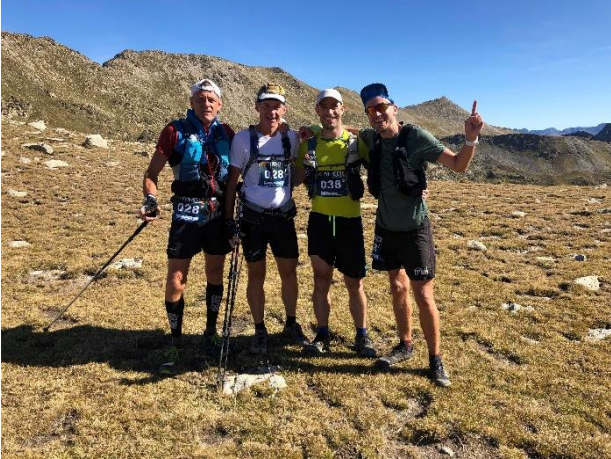
A brief truce with the Germans