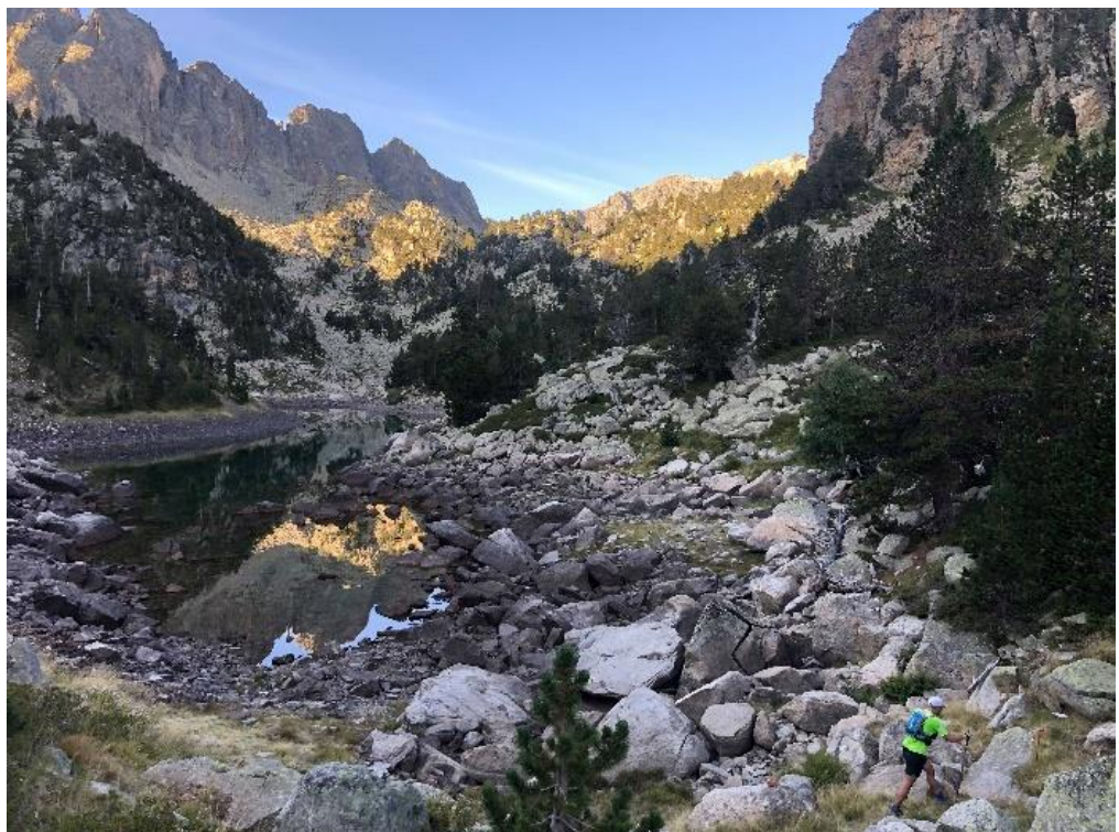
The Pyrenees did not disappoint