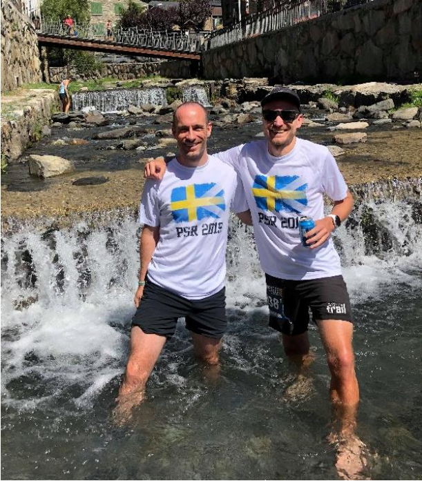
Post-stage cool down