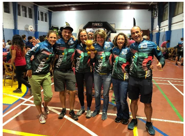
A Cosmic, a Swede and four Deeside ladies

There were standing ovations for the volunteers, all the runners got a PSR jacket and then most people went to