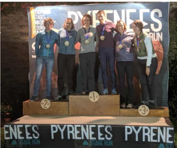
Another day, another podium for the Deeside ladies

I don't need to mention how the Deeside ladies got on, they were in great spirits and it was another relaxing and enjoyable dinner and briefing. Why did this holiday have to end?