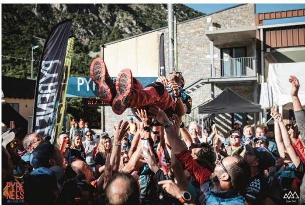
Finish line party