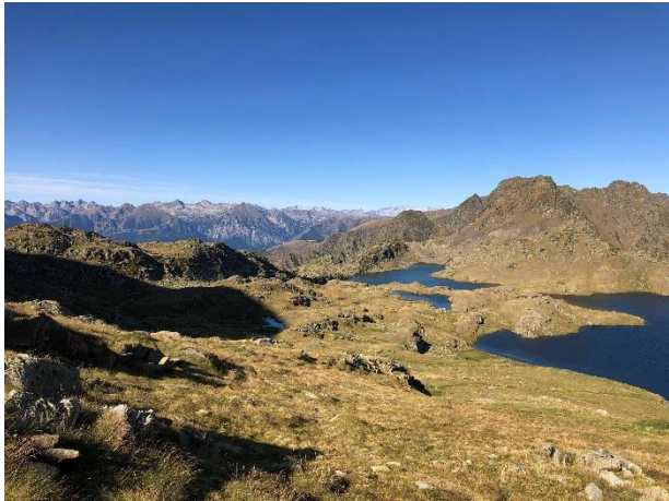
Spot any salamanders?