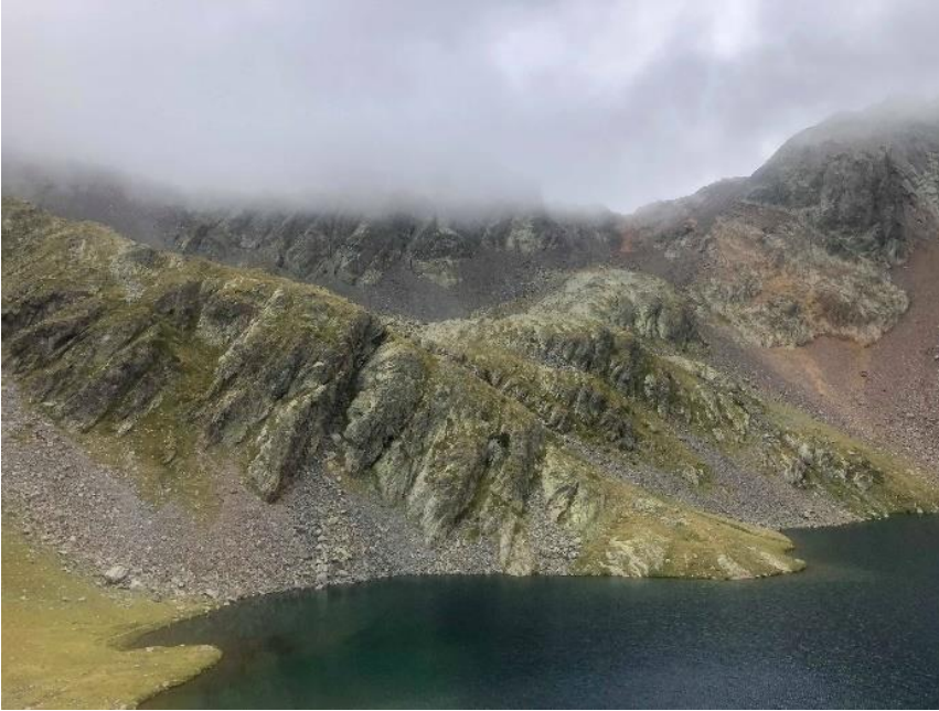
Big mountain terrain

We watched the clock tick by and after they came in were still 7 th overall but only 7 minutes from 5 th , we had a great target for the final two days.