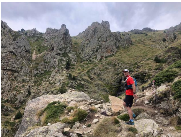
The long traverse

Day one had seen a mix of green, blue and red, but day two promised to be a lot more runnable with less technical terrain, even if there was still plenty of climb